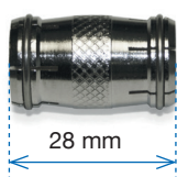
F250L Connection F male - F male